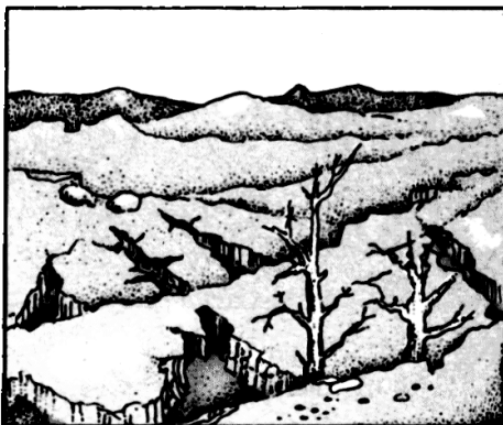
Loss of plant cover leads to soil erosion.